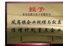
Double Key Enterprise